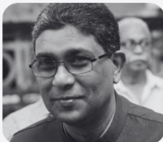
JUSTICE AKJ NAMBIAR Kerala High Court