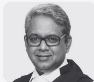
JUSTICE SURAJ GOVINDRAJ Karnataka High Court