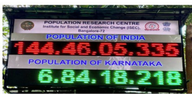
The digital population clock at the ISEC in Bengaluru, SPECIAL ASSIGNMENT