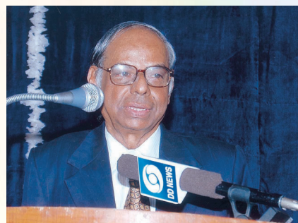
Dr C Rangarajan, Chairman, Economic Advisory Council to the Prime Minister, inaugurating the Conference.

The Conference was inaugurated by Dr C Rangarajan, Chairman, Economic Advisory Council to the Prime Minister.