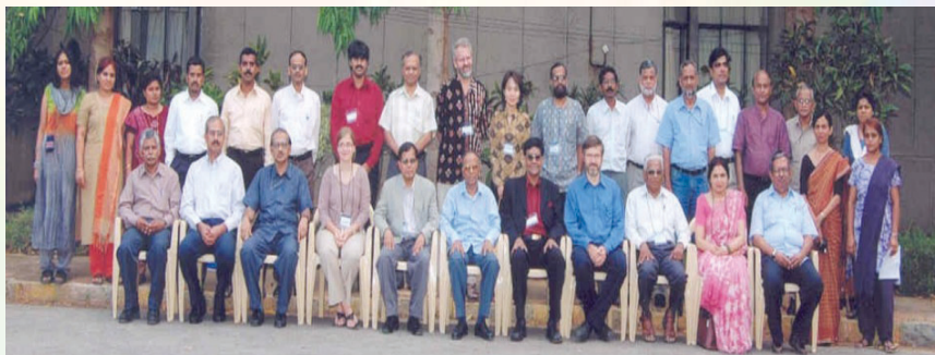
Participants at the Asia Regional Workshop on Compensation for Ecosystems Services held at the Institute.

The Centre for Ecological Economics and Natural Resources of the Institute for Social and Economic Change, Bangalore, organised a three-day Asia Regional Workshop on Compensation for Ecosystems Services during May 8-10, 2006. The Asia Regional Workshop was conducted as a component of the Global Scoping Study on Compensation for Ecosystem Services (CES), coordinated by the International Centre for Research in Agroforestry (ICRAF), Nairobi, Kenya, and commissioned and funded by the International Development Research Centre (IDRC), Canada. This workshop was organised in association with ICRAF. His Excellency Shri T N Chaturvedi, Governor of Kanataka and President of ISEC, inaugurated the workshop and delivered the keynote address. The workshop was organised to synthesise the experiences of 'compensating for