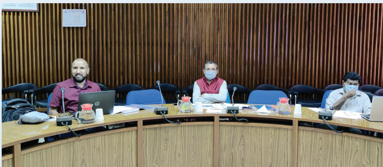
Centre for Ecological Economics and Natural Resources, ISEC and Department of Environmental Science, University of Mysore jointly organised a national webinar on Climate Change Ecological Restoration and Socio-Ecological Sustainability on July 2, 2021 through Zoom.