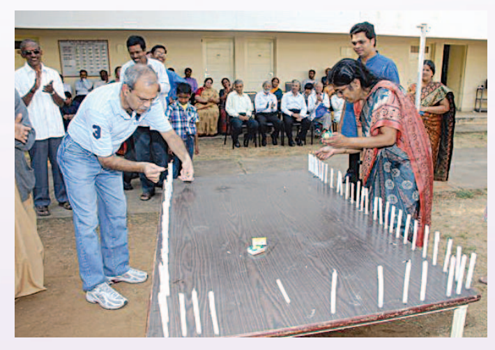
ISEC faculty, students and alumni participated in a variety of games and cultural performances during the 'Grand Alumni Meet' hosted by ISEC to coincide with the Founders' Day celebrations on January 20-21, 2012.