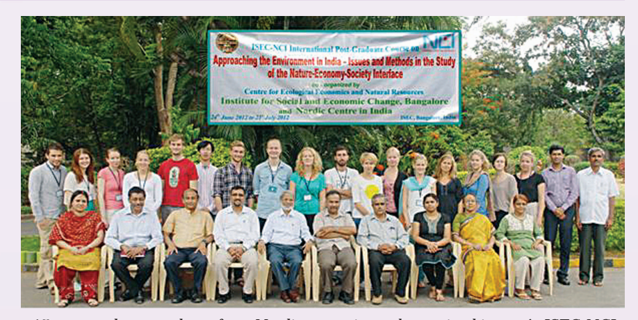
17 post-graduate students from Nordic countries took part in this year's ISEC-NCI course on 'Approaching the Environment in India – Issues and Methods in the Study of the Nature-Economy-Society Interface' held from June 24 to July 21, 2012.

The Centre for Ecological Economics and Natural Resources (CEENR), Institute for Social and Economic Change (ISEC) in association with the Nordic Centre in India (NCI), Sweden, organised a four-week interdisciplinary course on 'Approaching the Environment in India - Issues and Methods in the Study of the Nature-Economy-Society Interface' for postgraduate students from Nordic countries from June 24 to July 21, 2012. Totally 17 post-graduate students from universities in Denmark, Sweden, Germany and Finland participated in this course. This is a regular postgraduate course equivalent to 10 or 7.5 ECTS (European Union Credits).