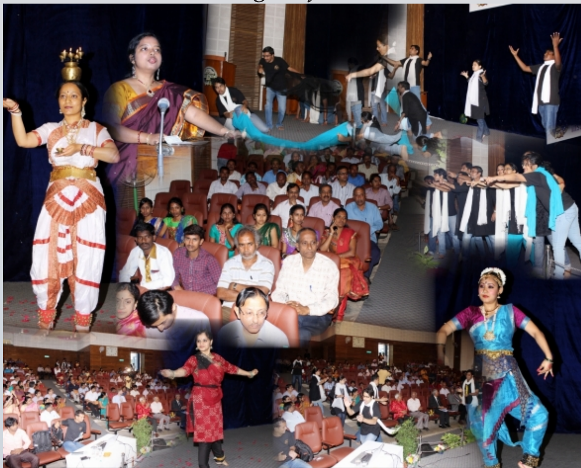
Many cultural programmes were held as part of the ISEC Founders' Day celebrations on January 20, 2014.