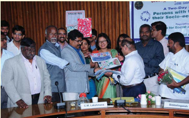
National seminar on 'Persons with Disabilities and their Socio-economic Status in India' organised by Population Research Centre on June 28 and 29, 2018.