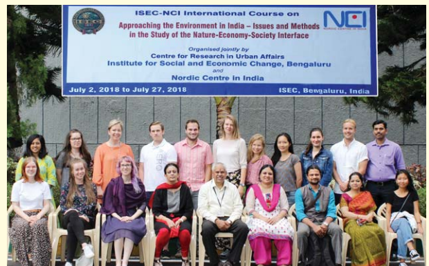
Centre for Research in Urban Affairs, ISEC in association with the Nordic Centre in India, Sweden, organised a four-week course on 'Approaching the Environment in India: New Theories and Methods in the Study of the Nature-Society Interface', July 2-28, 2018.