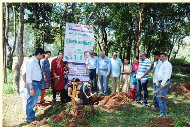
Planting of Saplings at ISEC campus - Green Sunday initiative, ISEC and Adhamya Chethana on October 7, 2018.