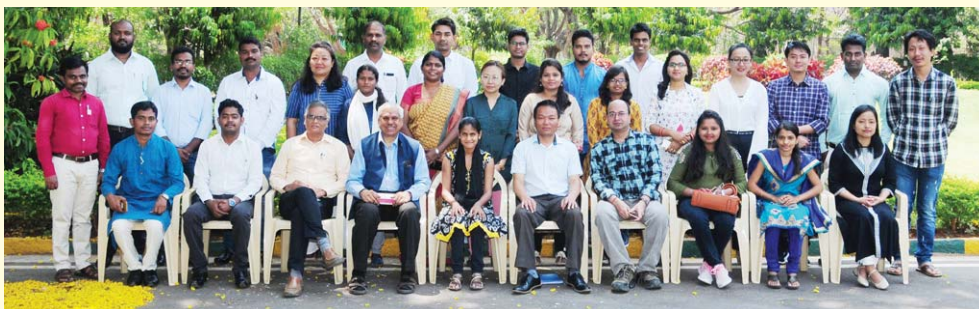
Research Methodology Course in Social Science Research for Scheduled Castes and Scheduled Tribes Research Scholars, March 21-30, 2019.