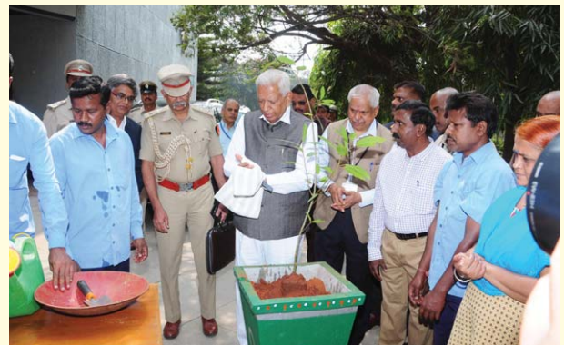
The president of ISEC Society Honourable His Excellency the Governor of Karnataka Shri Vajubhai Rudabhai Vala planting of sapling in ISEC on 46th Annual General Body Meeting on December 28, 2018.