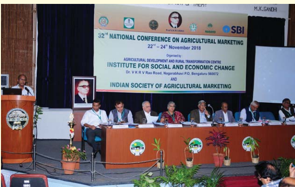
Agricultural Development and Rural Transformation Centre, ISEC organised a 32nd National Conference on Agricultural Marketing, November 22-24, 2018.