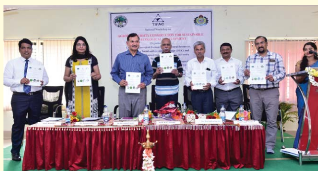
National Workshop on Agro-biodiversity Conservation for Sustainable Socio-Ecological Development, organised by CEENR, ISEC, September 24, 2018, at Mangalore.