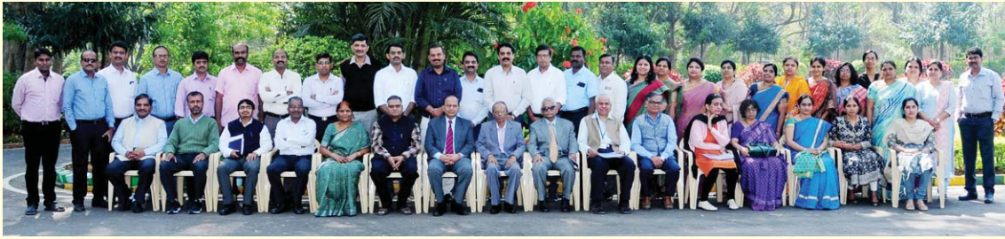
Executive Education Programme on Public Policy and Governance (PPPG), offered to the state government civil service officers, January 7 to February 2, 2019.