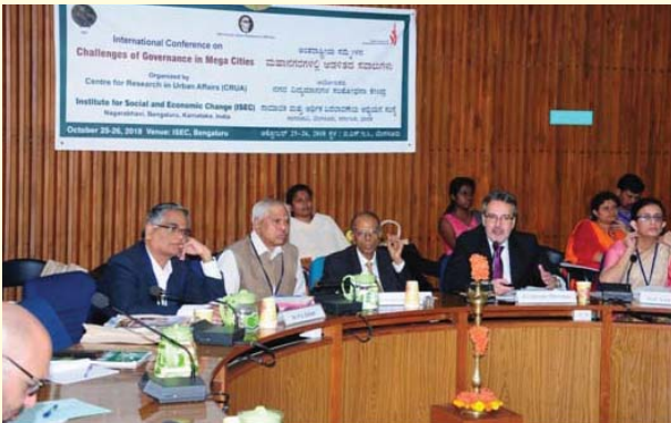
Centre for Research in Urban Affairs organised the International conference on the 'Challenges of Governance in Mega Cities', October 25-26, 2018