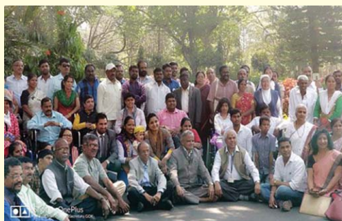
The first national workshop on mainstreaming the disabled was organised by the Ramakrishna Hegde Chair on Decentralisation and Development at ISEC.