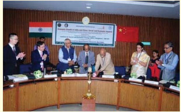
An International Conference on the Social and Economic Impacts of the Economic Growth in India and China, ISEC and Sichuan Academy of Social Sciences (SASS), organised by CRUA, September 27-28, 2018.