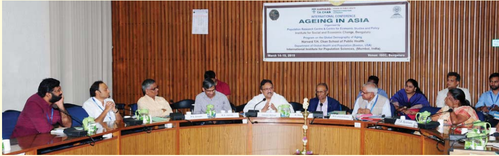
International Conference on 'Ageing in Asia' in collaboration with the Programme on the Global Demography of Ageing at Harvard TH Chan School of Public Health, Boston, USA and the International Institute for Population Sciences, Mumbai, March 14-15, 2019