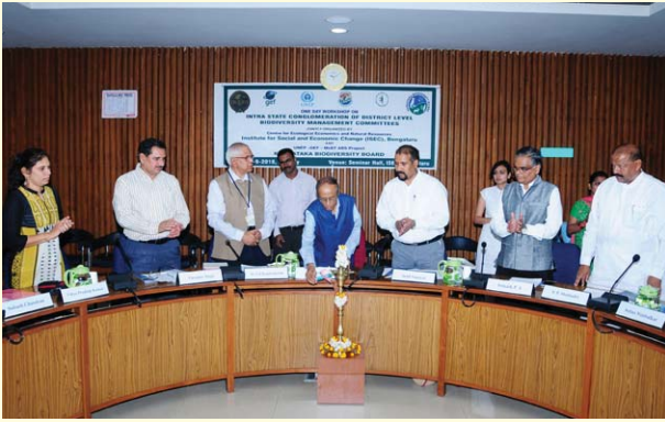
Workshop on Intra State Conglomeration of District Level Bio-diversity Management Committees, organised by CEENR, ISEC, Bengaluru and Karnataka Biodiversity Board, Bengaluru, September 10, 2018.