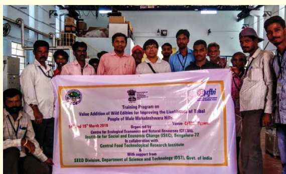
Workshop on Socio-economics Development through Value Addition, organised by CEENR, ISEC in collaboration with CSIR - Central Food Technological Research Institute (CFTRI) on March 14-15, 2019, at CFTRI, Mysore.