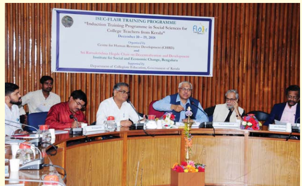
Fostering Linkages in Academic Innovation and Research (FLAIR) Induction Training Programme in Social Sciences for College Teachers from Kerala, organised by Sri Ramakrishna Hegde Chair and CHRD, ISEC, December 10-19, 2018.