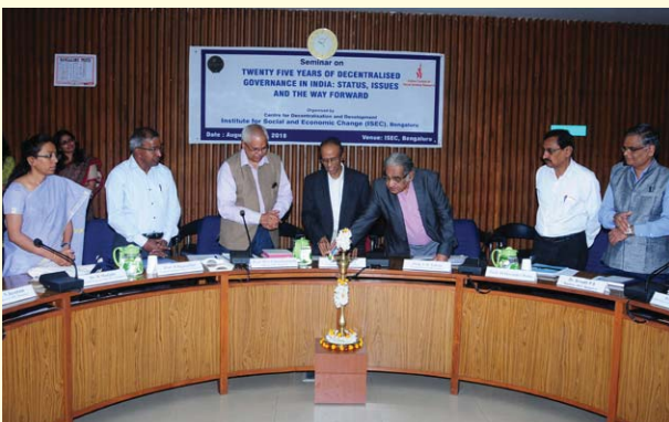
International seminar on 'Twenty Five Years of Decentralised Governance in India: Status, Issues and the Way Forward' was organized by the Centre for Decentralisation and Development, August 28-30, 2018.