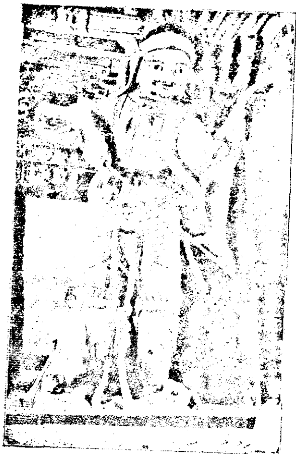
HINDU GUARDIAN OF A KOREAN BUDDHIST SHRINE. (A LIVING KOREAN STANDS AT THE FOOT)