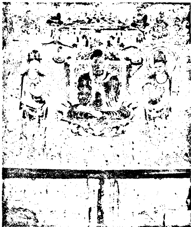
WALL PAINTING, HORYUJI TEMPLE, JAPAN (By Korean Artists, in the Asuka Manner)